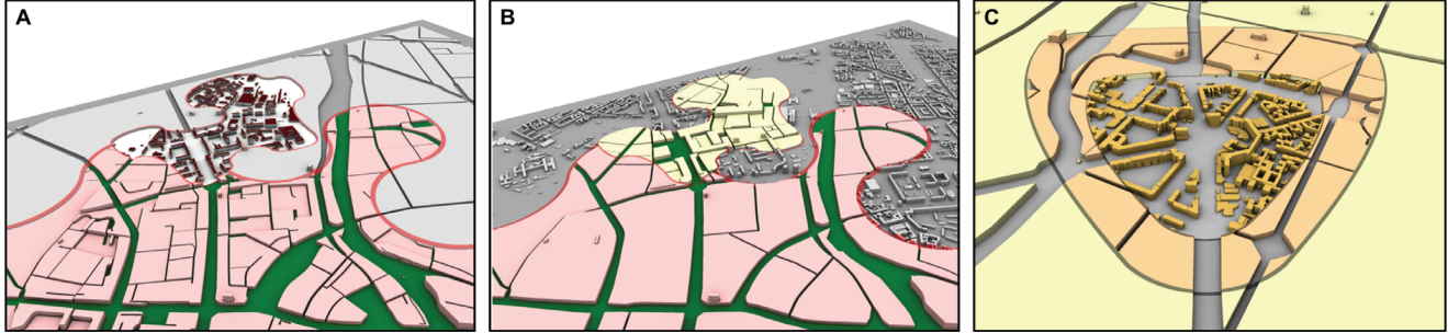
Figure 4. Application examples for 3D Generalization Lenses. Figure A and B show multiple overlapping lenses with different mappings. Figure C shows two nested, camera lenses.