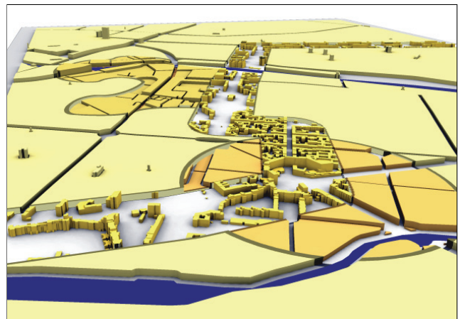
Figure 1. A route through the virtual city model is visualized using our generalization lenses: The route is presented in detail, the context is shown generalized. In addition, two more lenses show different degrees of generalization.

The concept of focus + context visualization addresses this need by combining different representations of a model in a single image [24]. For a 3D virtual environment, 3D lenses can be used as a metaphor to control the focus + context visualization [23]. They direct the viewers attention to the focus region, i.e., the model inside the lens, and simultaneously preserve the context information, i.e., the model outside of the lens.